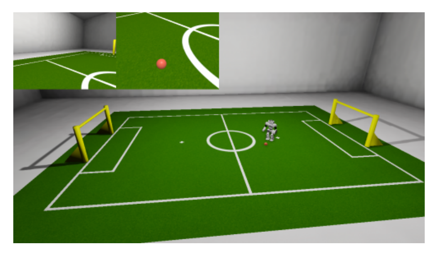
Figure 2: A simulation of a Nao robot in USARSIM environment

The 3D robot simulation environment (USARSim) is extended with the possibility to reproduce the appearance and the dynamics of generic legged robots and especially a humanoid Nao robot. USARSim is based on the Unreal Engine, which provides facilities for good quality rendering, physics simulation, networking, highly versatile scripting language and a powerful visual editor. Building a realistic simulator implies that interaction models are needed which replicate the dynamics of a walking robot with many body contacts, while maintaining a fast frame rate. Several approximations have been tried, and the performance evaluated. This extension could have a wide application range, which allows people to develop and experiment typical robotic tasks at home, without requiring a real robot. The development of this open source simulation is not